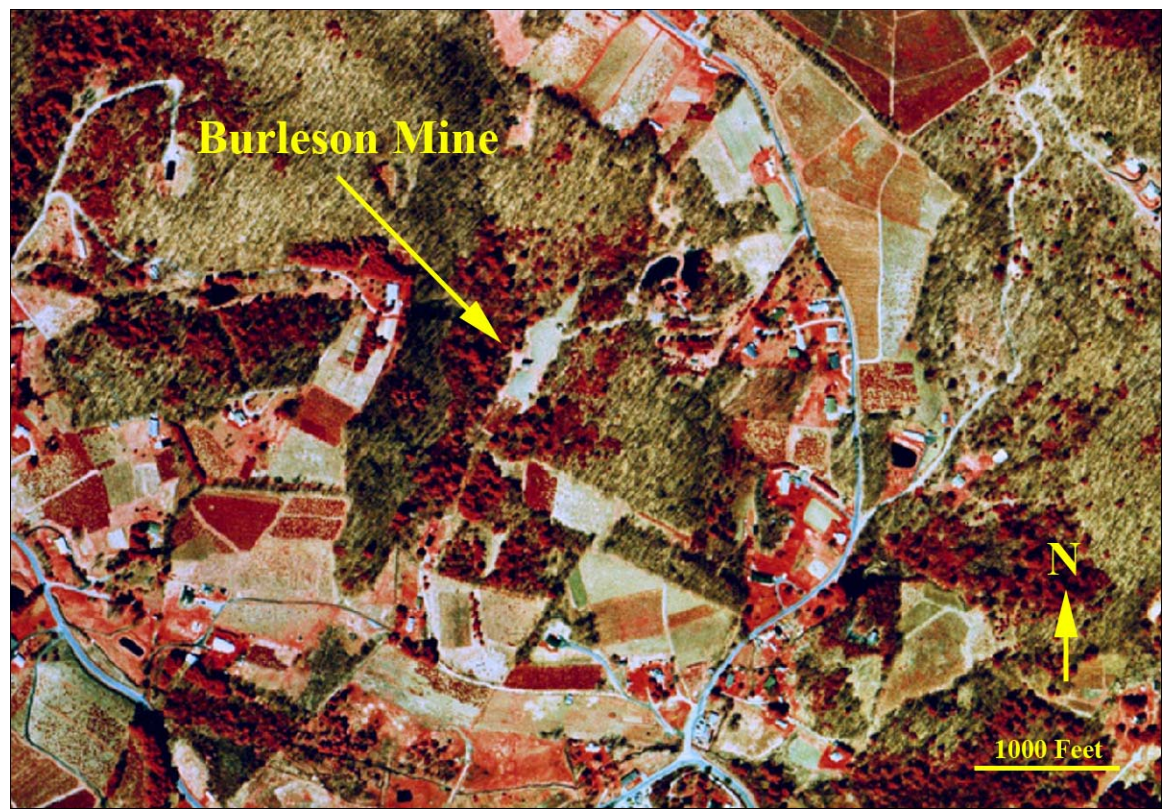
Color IR orthophoto of the Burleson mine area.